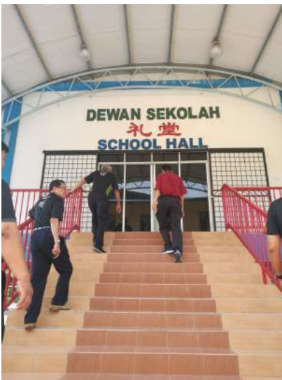
In the meantime, our Director and NS Principal had the chance to visit SMK Tinggi's extensive campus and learn more about their school management policies and philosophies.