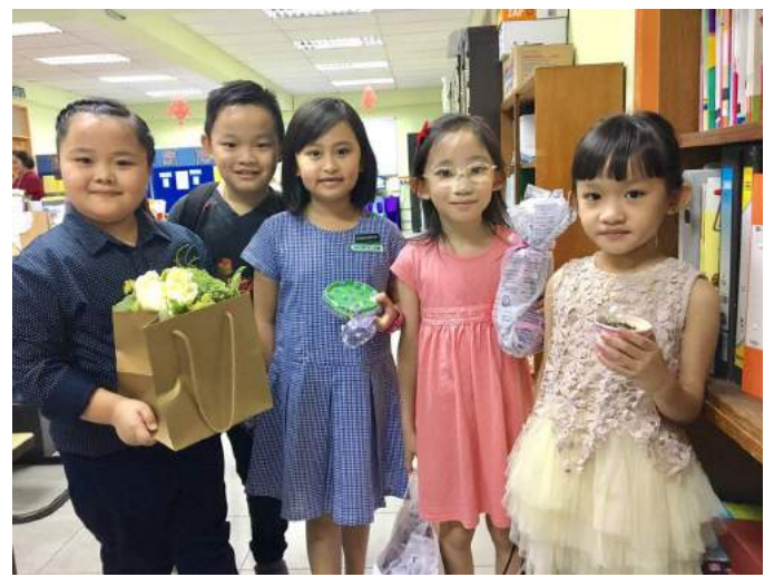
...to warm wishes from our National Primary and National Secondary students and teachers ...