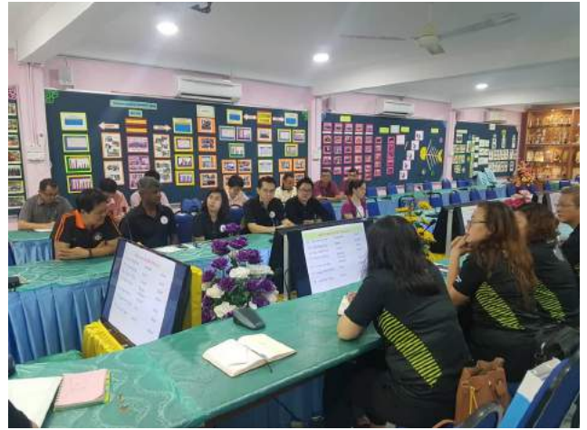
Our teachers were engaged in the presentations given by both outstanding schools.