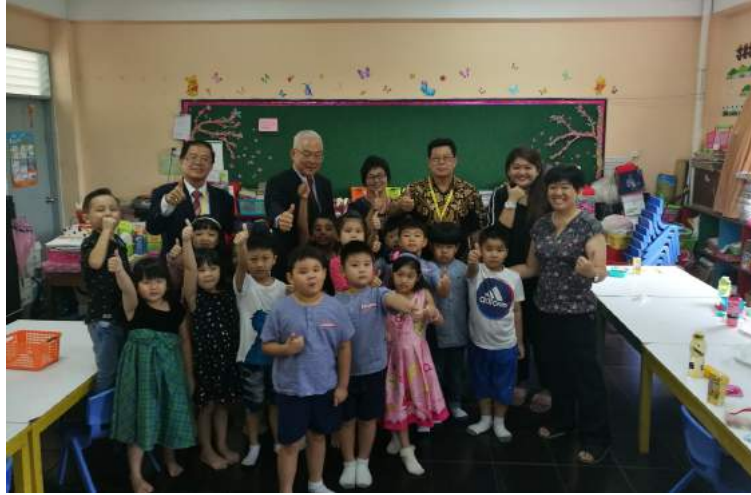
From our children at Kindergarten...